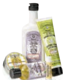
Natural Body Care pages 9-15