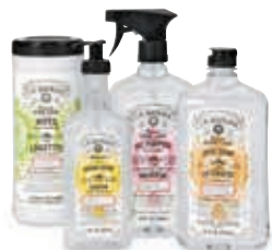
Natural Plant-Based Home Care pages 16-20