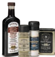
Natural Gourmet pages 3-8

All of the above Points of Superiority make up THE WATKINS WAY, and you will agree that it is a good way.