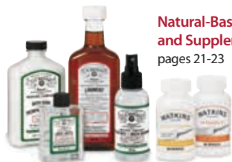
Natural-Based Remedies and Supplements pages 21-23